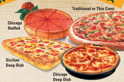
Traditional or Thin Crust